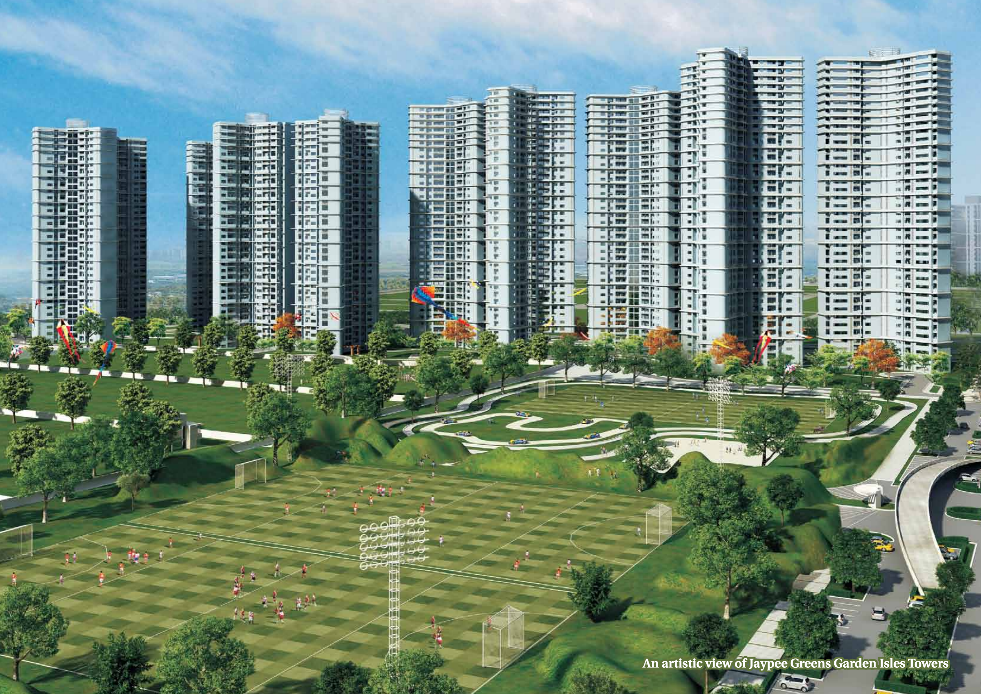
An artistic view of Jaypee Greens Garden Isles Towers